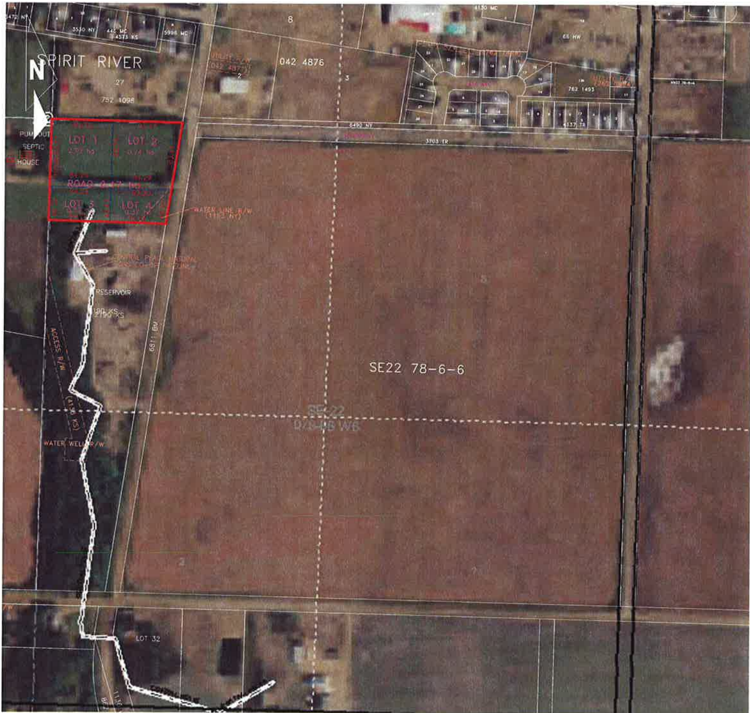
LOCATION PLAN WITH PHOTO SCALE 1:2500